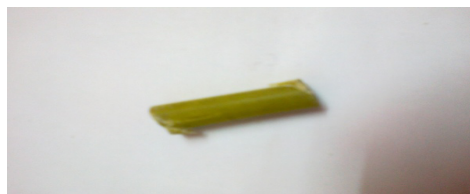
Fig. 18: After test.