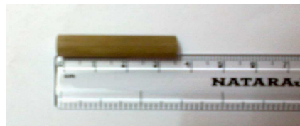
Fig. 5: Pultruded bar (30*10 mm).

Compressive strength Compressive modulus