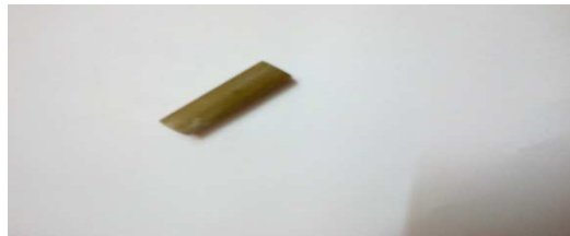
Fig. 15: Pultruded bar Before test.