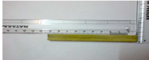
Fig. 8: SMC bar (100*12.7*6 mm).