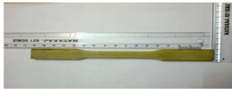
Fig. 4: SMC bar (170*19*6 mm).