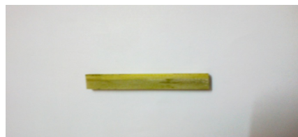
Fig.25: SMC bar Before test.