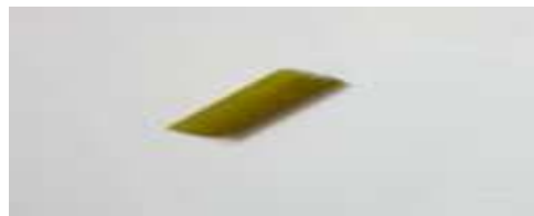
Fig. 17: SMC bar Before Test.