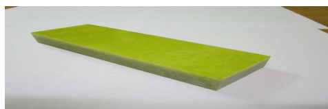
Fig. 2: SMC bar (160*55*20 mm).