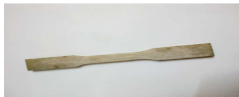
Fig. 11: Pultruded bar Before test.