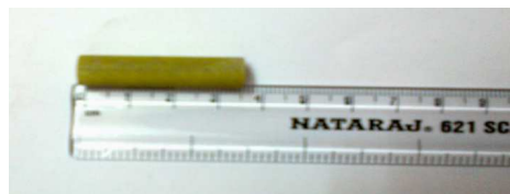
Fig. 6: SMC bar (30*10 mm).