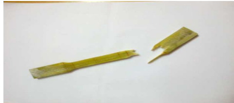
Fig. 14: After Test.