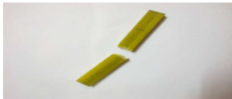
Fig. 22: After test.