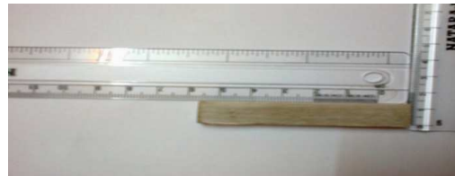
Fig. 9: Pultruded bar (65.5*12.7*6 mm).