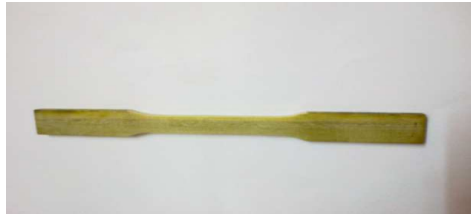
Fig. 13: SMC bar Before test.