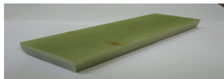
Fig. 1: GFRP composite materials used Pultruded bar (160*55*20 mm).

Low recyclability. Cost can fluctuate. Can be damaged. Anisotropic properties. Low reusability.