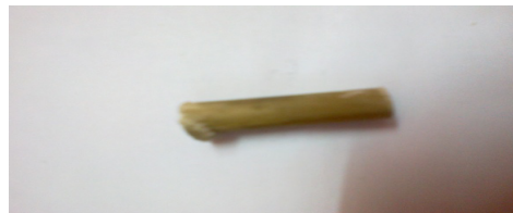
Fig. 16: After test.