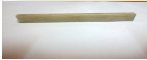
Fig. 19: Pultruded bar Before test.