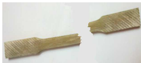
Fig. 12: After Test.