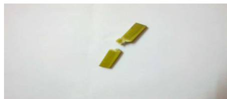
Fig. 26: After test.