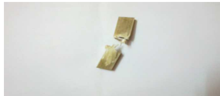
Fig. 24: After test.