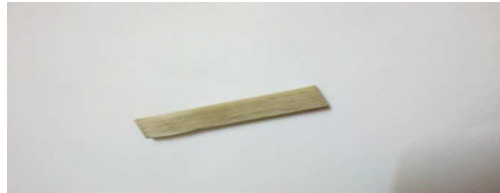
Fig. 23: Shear Test Pultruded bar Before test.