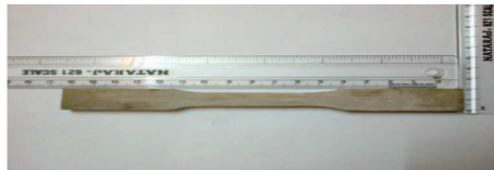
Fig. 3: Pultruded bar (170*19*6 mm).

Tensile Strength Tensile Modulus Tensile elongation