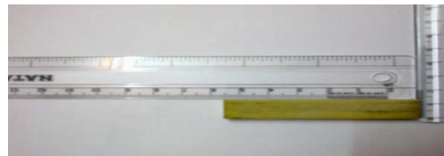
Fig. 10: SMC bar (65.5*12.7*6 mm).