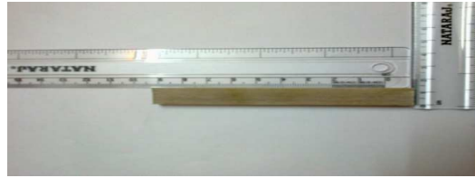
Fig. 7: Pultruded bar (100*12.7*6 mm).