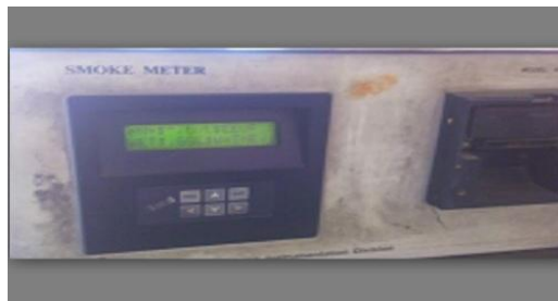
Fig. 6.2: Smoke meter.