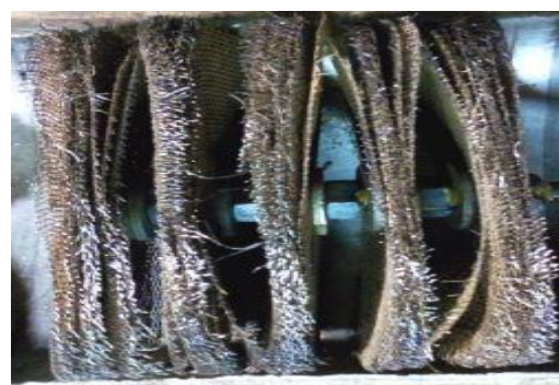
Fig. 4.3: Mesh Package or Converter Substrate.

The size of the washer used in the packing was 1 cm in a diameter and 1cm of hollow diameter with thickness around 0.2 cm.