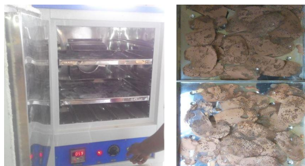
Fig. 4.1: Heat Treatment.

Heat treatment are done to get the complete catalyst substrate. Heat treatment is a process of treating the dried wire meshes with presence of required heat for a period of time.