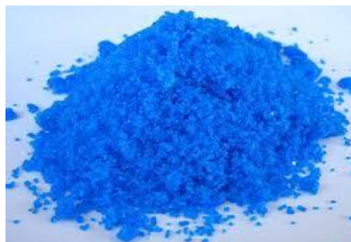
Fig. 3.5: Copper Nitrate.

Hydrated copper nitrate can be prepared by hydration of the anhydrous material or by treating copper metal with an aqueous solution of silver nitrate or concentrated nitric acid.