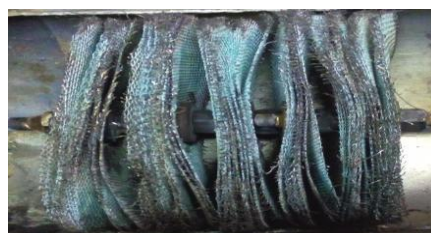
Fig. 4.2: Mesh Package or Converter Substrate.

The size of the washer used in the packing was 1 cm in a diameter and 1cm of hollow diameter with thickness around 0.2 cm. The size of the nut is 1.6 cm in thickness and 1.5 cm outer diameter and 1 cm inner diameter. The stainless steel bars which was used as a wire mesh support which was screw type bar with a diameter of 1.2 cm and 20 cm length.