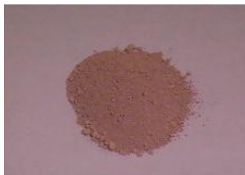
Fig. 3.4: Cerium oxide salt.

Copper nitrate also occurs as five different hydrates, the most common ones being the trihydrate and hexahydrate, these materials are more commonly encountered in commerce than in the laboratory.