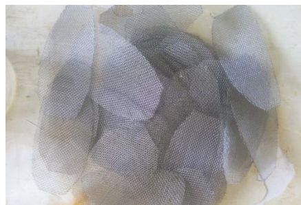
Fig. 2.1: Wire mesh.

cerium based are separated and the wire meshes are arranged before welding.