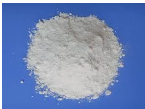
Fig. 3.6: Zirconium Dioxide.