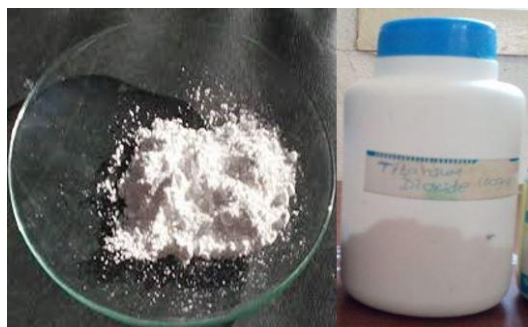
Fig. 3.1: Titanium Dioxide.

Titanium dioxide also known as titanium (IV) oxide or Titania, is the naturally occurring oxide of titanium, chemical formula \text{TiO}_2 . It has a wide range of applications, from paint to sunscreen to food coloring. When used as food coloring, it has E number.