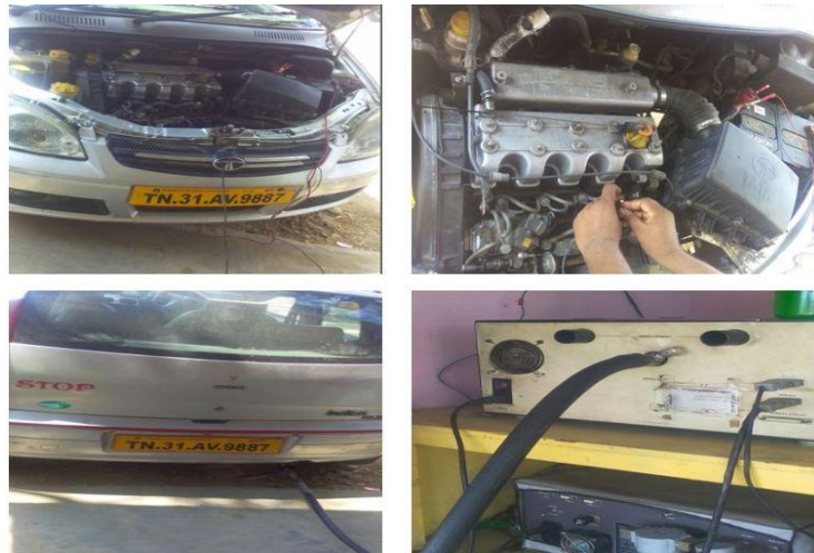
Fig. 6.1: Emission Testing of Diesel Engine.