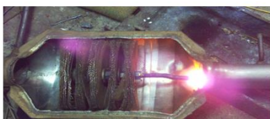
Fig. 5.1: Welding of Catalyst substrate Package.

The same outer dimensions were purposely fixed in order to avoid redesign of the existing exhaust system, which then required further thermal optimization and design validation studies.