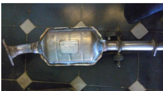
Fig. 5.2: Titanium Based catalytic Converter.

After the welding process completed the new catalytic converter is ready for final testing procedures. There two converters prepared finally since two separate catalytic substrate is prepared for reducing the exhaust harmfulness from the automobiles.