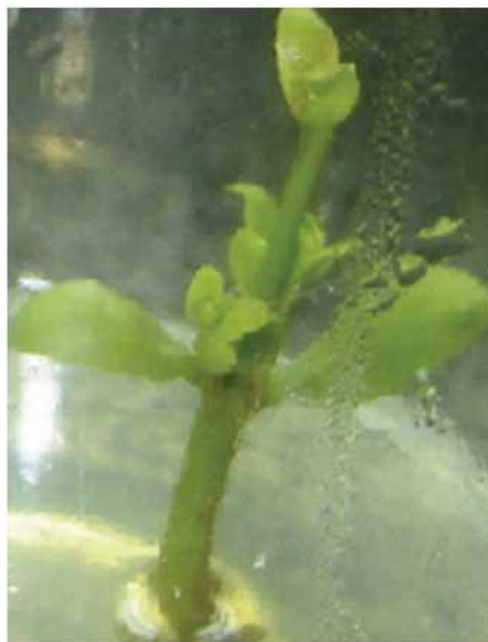
Fig. 3: - effect of 1.25 WPM+ 7. 0 mg -1 IBA + 0.5 mg -1 IAA