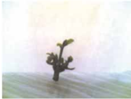
Fig. 1: - Effect of MS + 0.1mg -1 2iP + 0.5 mg -1 IAA+ 2.0 mg -1 Kin