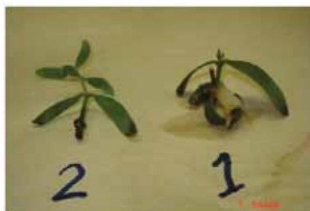
Fig. 4: Effect of IBA on the root formation of Jojoba cultured on MS medium