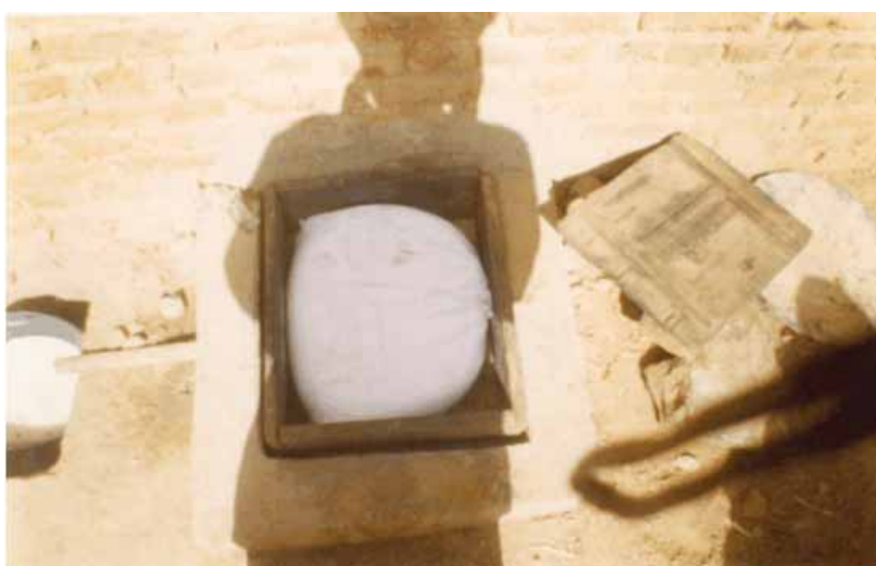
Plate 2: Curd in sack of cloth in the mould ready for pressing, Zalingei, West Darfur State, Sudan