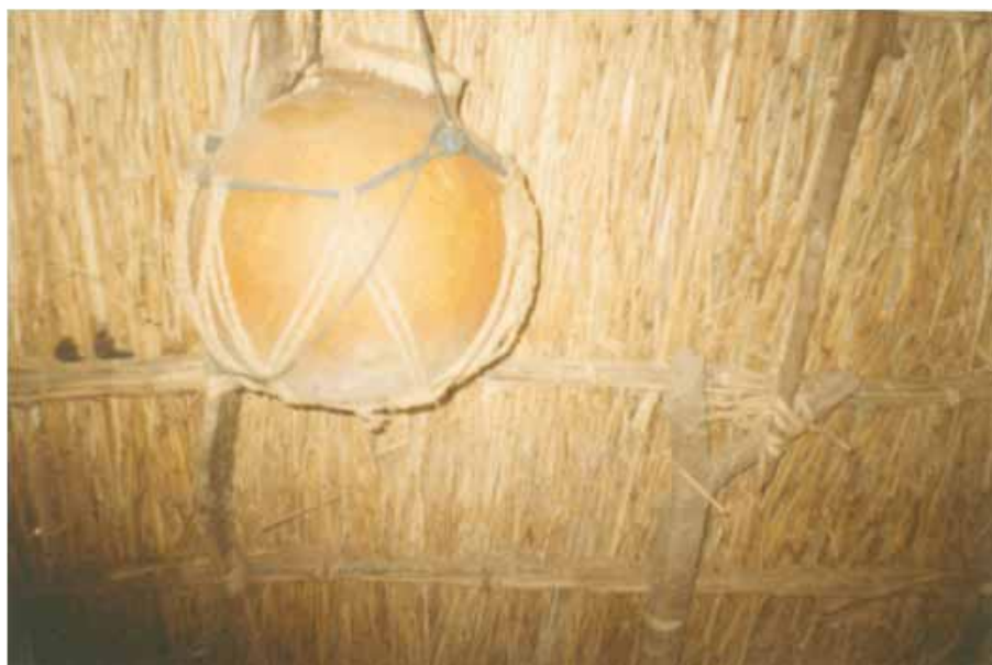
Plate 4: Gourd ( bokhsa ) (Local churner) used for churning fermented milk, Zalingei, West Darfur State, Sudan.

The average fat content of cheese samples was 22.80% (Table 1), and the fat ranged between 19.17-23.83%. The fat content values were higher than those reported by Aly and Galal (2002) and Khalid and El Owni (1991) who reported fat values of 12.80 and 11.70, respectively. The high average fat contents in this study could be due to high fat content in milk of Baggara cattle (zebu cattle) used for cheese making.