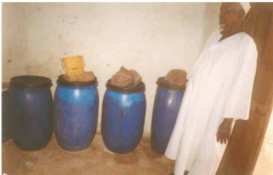
Plate 3: Plastic barrels with ( Gibna Bayda ) in salted whey stored at room temperature, Zalingei, West Darfur State, Sudan