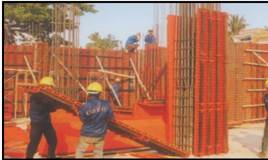
Fig. 3: Simple form system.