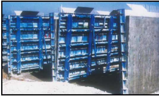
Fig. 2: Column Work.