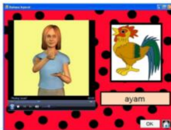
Fig. 1: Screen shot of eBIM

be conclude that static graphics and animations have been utilized to attract the young deaf children utilizing the courseware.