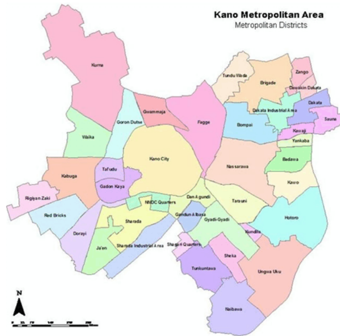
Fig. 1a: Kano metropolitan area and the various districts.