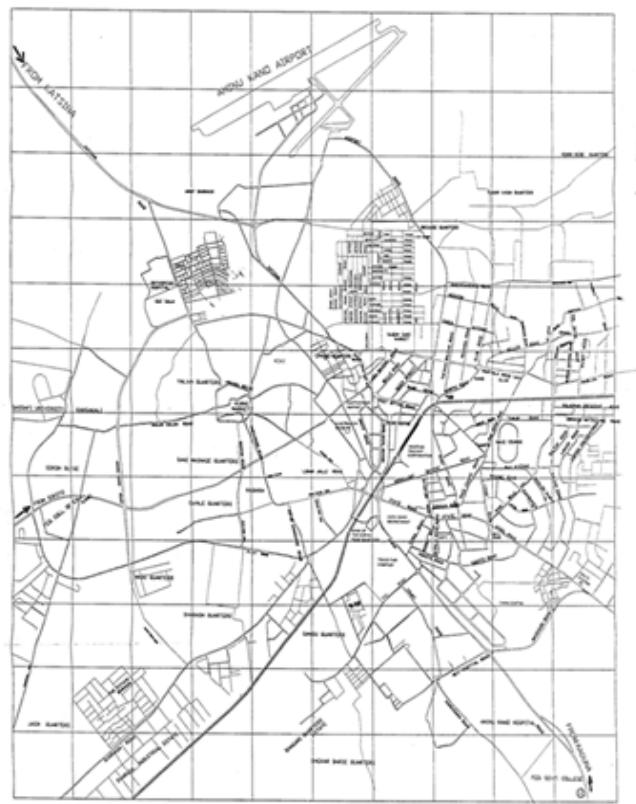
Fig. 1b: The street layout and settlements of the study area.